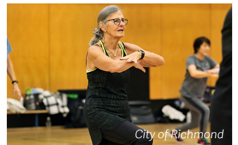
City of Richmond

The City and partners are proud to offer high-quality social programs and services for those 55+ years at eight community facilities, including the Seniors Centre at the Minoru Centre for Active Living.