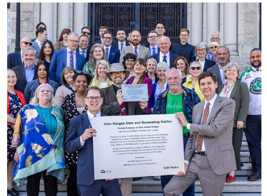
Press Release gov.bc.ca